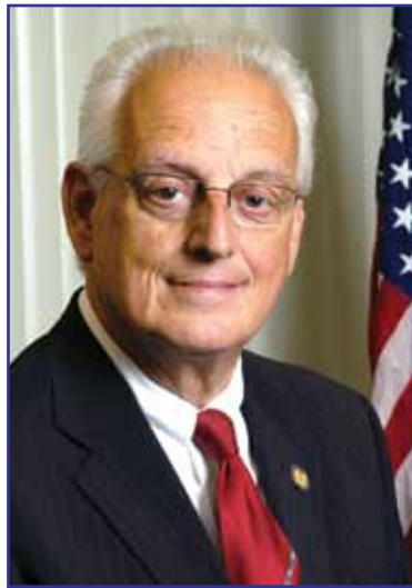
Congressman Bill Pascrell, Jr.

Joins Sens. Udall, Klobuchar, Blumenthal on bill addressing false safety claims for sports gear