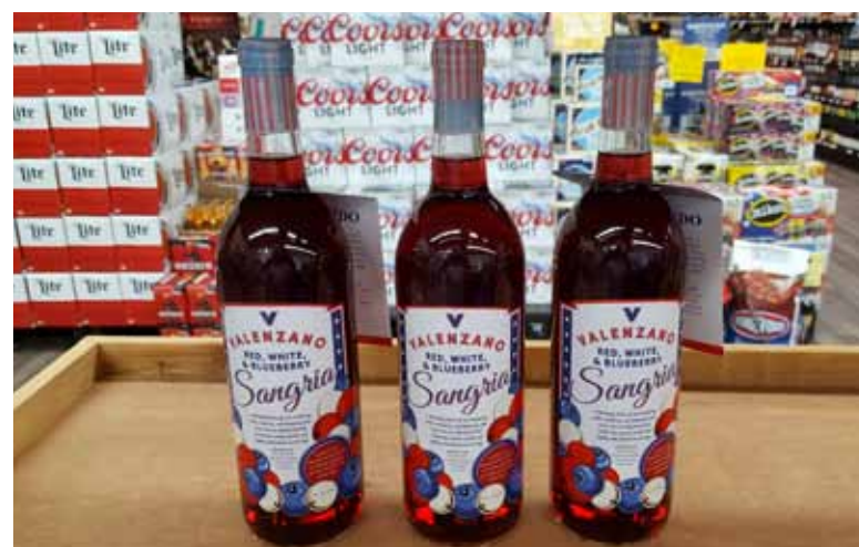
Valenzano red white and blueberry Sangria tasting July 1 3pm to 5pm

Valenzano Red White and Blueberry Sangria Tasting July 1, 3 - 5pm