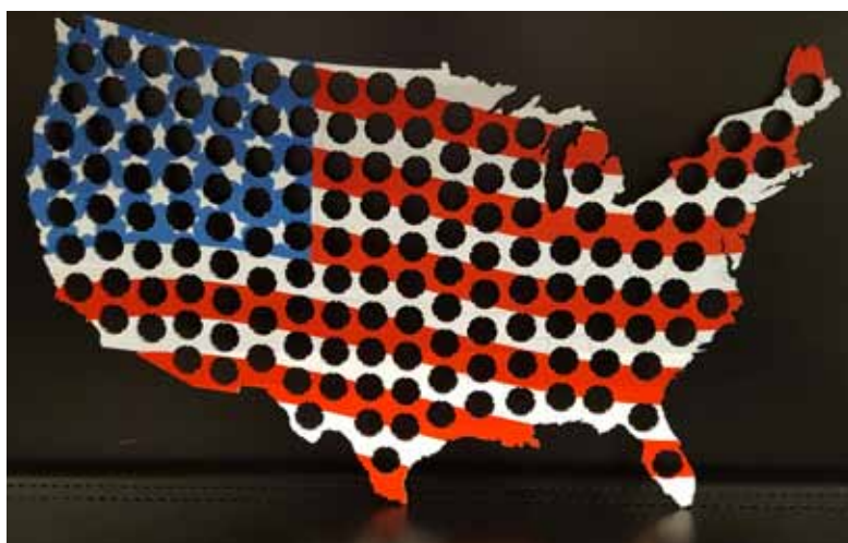
A patriotic bottle cap collector plaque available from our gift center

We Have All You Need For Your Summer Entertaining Cold Beer Lots of Ice Burgers, Hot Dogs and Snacks