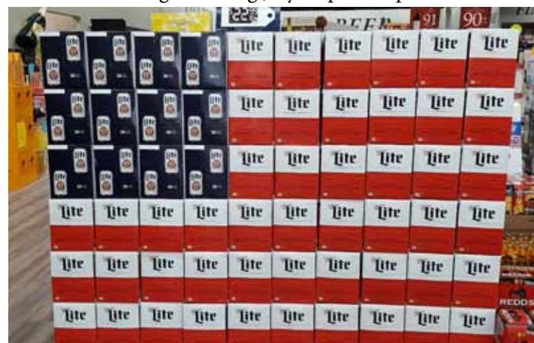
Just in time for July 4th, Miller Lite in patriotic attire.

895 Paulison Avenue, Clifton - 973-883-1017 - Mon - Thurs: 9am - 9pm / Fri - Sat 9am - 10pm / Sun 10am - 7pm