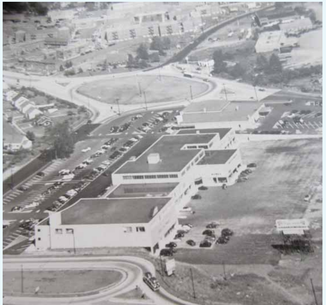
Aerial view of Styertown Shopping Center and the Allwood Circle circa 1950

Retail Restaurants Office Suites Styertown Center Has it All For Information call 973-591-5222