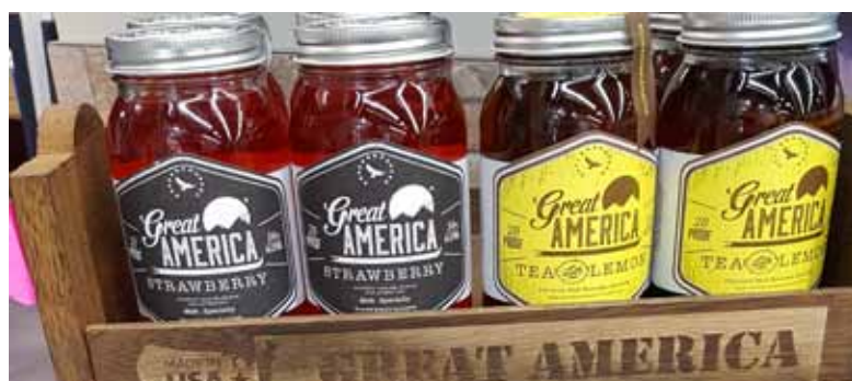
Great America, Malt Specialty, try all the flavors, strawberry, tea with lemon, lemonade, red, white, blueberry and peach.

Wine and Liquor Tastings Through-out the Month. . . Stop in the Store For up to the Minute Details!